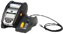
Single-bay QLn Ethernet Cradle