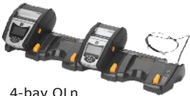
4-bay QLn Ethernet Cradle

Connect QLn printers to your wired Ethernet network via the QLn Ethernet cradle to enable easy remote management by your IT or operations staff — helping to ensure each printer is operating optimally and ready for use. The Ethernet cradle can communicate over 10 mbps or 100 mbps networks using auto-sense.