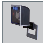
Wall-mount stand MLPN 46-00869