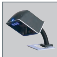
Flex-pole stand MLPN 46-00868