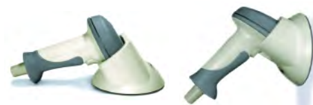
1100/1105 & 1200 Holder